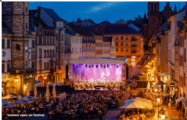
Summer open-air festival

Altenburg Castle, an architectural marvel, reigns over the town with its majestic presence. Here, visitors intimately encounter ducal living culture, cartography, and the town's history within its storied walls. Alongside the castle's captivating banquet halls, the diverse architectural styles present throughout the castle's structure are equally mesmerizing. The adjacent castle park, home to the quaint tea house and orangery, along with Lindenau Museum and the Mauritium Natural History Museum, offers a serene retreat. Exploring the trio of local churches – Friars' Church, St Bartholomew's, and St Agnes's – is a must for admirers of sacred architecture.