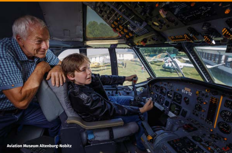
Aviation Museum Altenburg-Nobitz