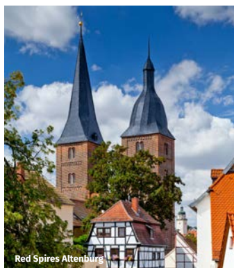
Red Spires Altenburg

The myth of the Red Spires being inspired by Emperor Frederick Barbarossa's beard adds charm to the town's history. These iconic red brick towers, built during his reign, are a notable landmark. However, the Altenburg Region has a lot more to offer. Posterstein Castle, Treben Manor and Schmölln's large market square are all gems just waiting to be discovered.