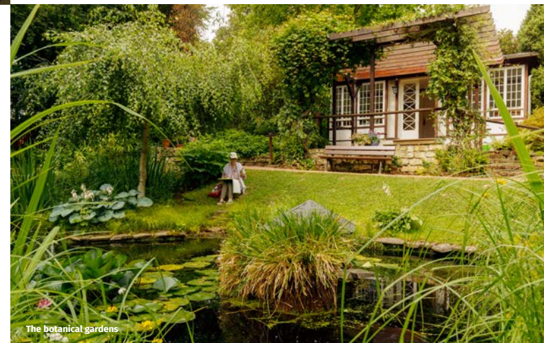
The botanical gardens

The Altenburg Region is a testament to a vibrant agricultural heritage, still alive and celebrated. Malcher and Marche are the names of the splendid costumes of the farming community, which are still worn in many places on special occasions. The ladies in particular – the Marchen – with their elaborate headdresses are a sight to behold on special occasions. In 2013, Altenburg peasant attire was honoured as Germany's traditional costume of the year. This living heritage is evident in the regions opulent four-sided farms and is celebrated at various annual events like the Garbisdorf Popinjay, Rositz Fair, and the Hartha Mill Festival, as well as at farmers' markets.