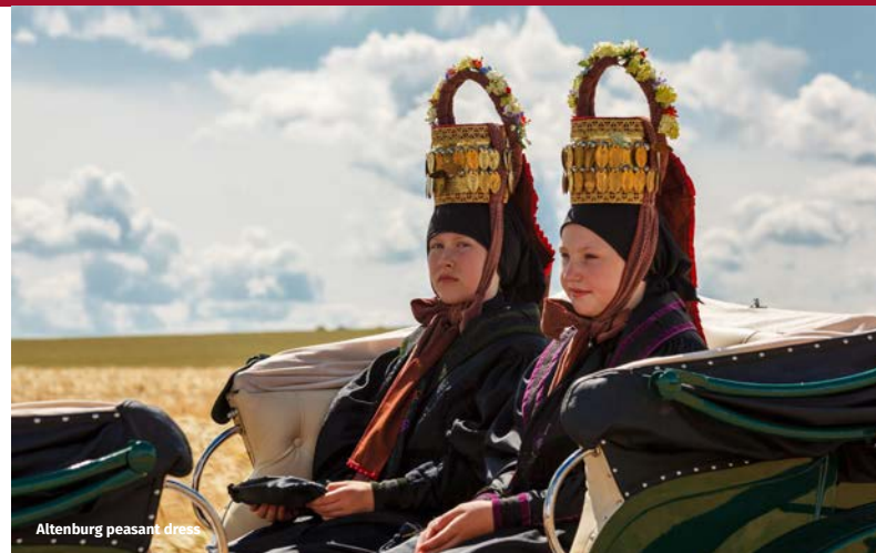
Altenburg peasant dress

Fondly known as the Little Semper Opera House, the theatre, designed in neo-Renaissance style by Semper's student Otto Brückwald, is a hub for art and culture. It's the only five-genre theatre in Thuringia. Although currently closed for refurbishment, its spirit lives on in the temporary theatre tent. Lindenau Museum, renowned among art-lovers for its impressive collection of plaster casts, is undergoing extensive renovation. Even so, a select display can still be enjoyed in the interim gallery at Kunstgasse 1.