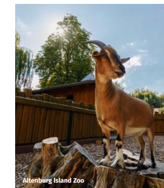
Altenburg Island Zoo

Nestled on an island in the Great Pond, Altenburg's Island Zoo is a unique attraction in central Germany, focusing on native species. The zoo not only features a petting enclosure but also offers numerous play activities. This makes it a memorable destination for families, where kids can engage with animals and enjoy various fun-filled adventures.