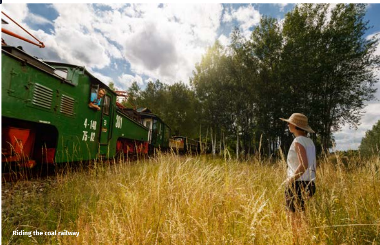
Riding the coal railway