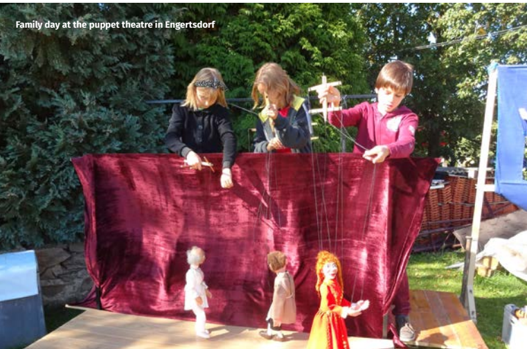
Family day at the puppet theatre in Engertsdorf

The Transall transport plane and the Atlantic anti-submarine aircraft are just two of the colossal original exhibits at the World of Aviation Museum at Altenburg-Nobitz Airport. Visitors can examine these awe-inspiring giants of the skies and even have a look inside the cockpit. Young visitors are enchanted by Dombrowsky's Puppet Theatre, now in its seventh generation. After more than a century of moving from place to place, this time-honoured travelling puppet show finally moved into a permanent venue in Engertsdorf in 1999. Alternatively, for a twist of excitement, try navigating your way through the intriguing Labyrinth House located inside converted barracks in central Altenburg. Don't worry, no one's ever got lost there – at least, not yet!