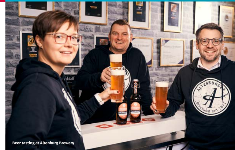
Beer tasting at Altenburg Brewery