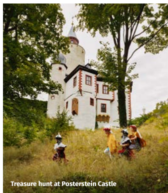
Treasure hunt at Posterstein Castle

The Altenburg Region is steeped in medieval allure, boasting castles, knights and legends. A visit to Posterstein Castle is a journey into history, standing majestically above its namesake village. The castle, along with its museum, hosts intriguing exhibits that bring to life the tales of knights, damsels, and the rich tapestry of medieval history.