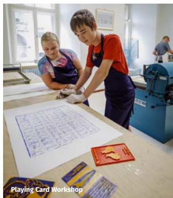
Playing Card Workshop

See Altenburg Castle's exquisite collection of historical playing cards, a testament to a craft dating back all the way to the 16th century. As well as admiring the exhibits, in the Playing Card Workshop visitors can engage hands-on in the traditional art of making playing cards, creating their own pieces to take home with them and cherish.