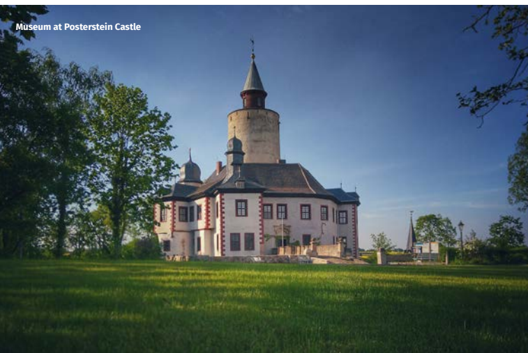
Museum at Posterstein Castle

The Tatami leisure pool in Schmölln and the indoor swimming baths in Altenburg, along with five outdoor pools in the region, are perfect for a day-long retreat. Nearby lakes like Haselbach near Wintersdorf, Hainberg near Meuselwitz, and Prössdorf near Lucka, as well as Pahna Park, provide excellent facilities for swimming, sailing, rowing, and even cycling, making them ideal spots for an active and enjoyable day out.