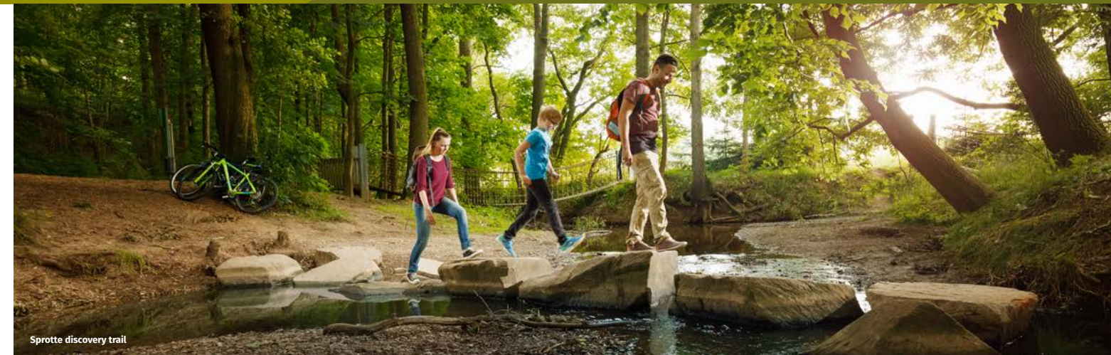
Sprotte discovery trail