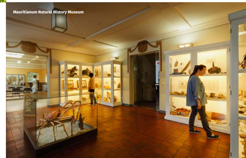
Mauritium Natural History Museum

Altenburg isn't just about rich history and playing cards; it's also a haven of green spaces. The sprawling castle park, with its ancient trees, lies at the town's heart, and is as old as the castle itself. Known as the unofficial capital of allotment gardeners, Altenburg is encircled by over 70 allotment gardens, providing a lush green belt through and around the town. The historic area around the Great Pond is perfect for leisurely strolls or boat rides. The botanical gardens, a showcase of rare flora, are another highlight, while the town forest is ideal for long, serene walks amid unspoilt nature.