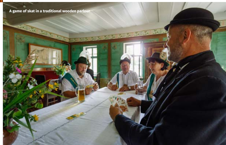
A game of skat in a traditional wooden parlour

The myth of the Red Spires being inspired by Emperor Frederick Barbarossa's beard adds charm to the town's history. These iconic red brick towers, built during his reign, are a notable landmark. However, the Altenburg Region has a lot more to offer. Posterstein Castle, Treben Manor and Schmölln's large market square are all gems just waiting to be discovered.