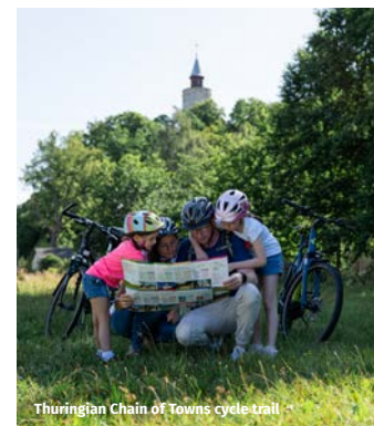
Thuringian Chain of Towns cycle-trail

Altenburg Region is interlaced with an extensive network of cycle paths, making its numerous attractions easily accessible by bike. Altenburg is the starting point for the Thuringian Chain of Towns cycle trail, offering active holidaymakers a picturesque route to explore Thuringia's natural beauty.